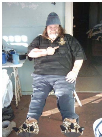
It Lives Yes the Pilliga Yowie does exist